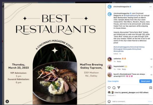
CM Social Media